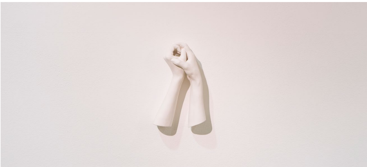
Image: Amalia Pica, Extended ears , 2017. Commissioned by The Power Plant, Toronto.