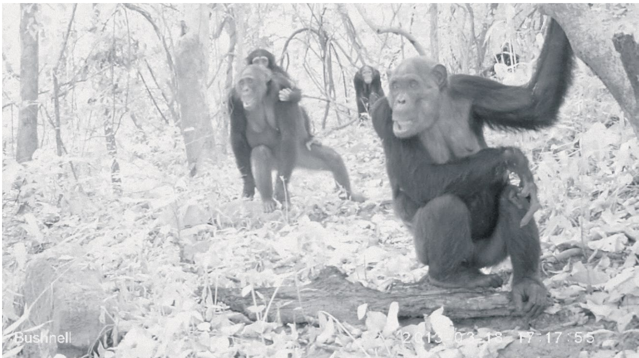
Images: Amalia Pica/Rafael Ortega, Pan troglodytes ellioti and cousins , 2016.