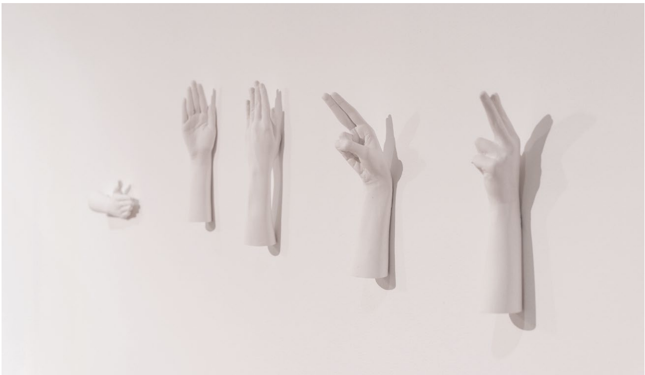
Image: Amalia Pica, please, open, hurry (in memory of Washoe) , 2018.

Curated at PICA by Eugenio Viola, please open hurry has been developed in partnership with The Institute of Modern Art, Brisbane, and The Power Plant, Toronto with the generous support of the Keir Foundation.