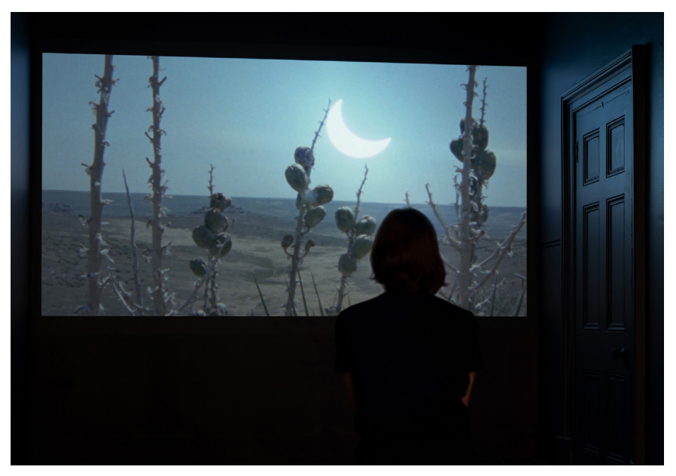
Image: A.K. Burns, Untitled (eclipse) , 2019, single-channel 16mm film transfer to HD video. Installation view, Perth Institute of Contemporary Arts (PICA), 2024.

This silent film by American artist A.K. Burns was recorded in Nebraska, USA. It shows the movement of our sun as it is gradually eclipsed by the moon and is superimposed onto the desert landscape where it was filmed. As the moon blocks the sun, midday momentarily becomes midnight, and the sun is transformed from a source of life into a void. The video shows a rare fleeting moment, heightening our awareness that the world is constantly changing.